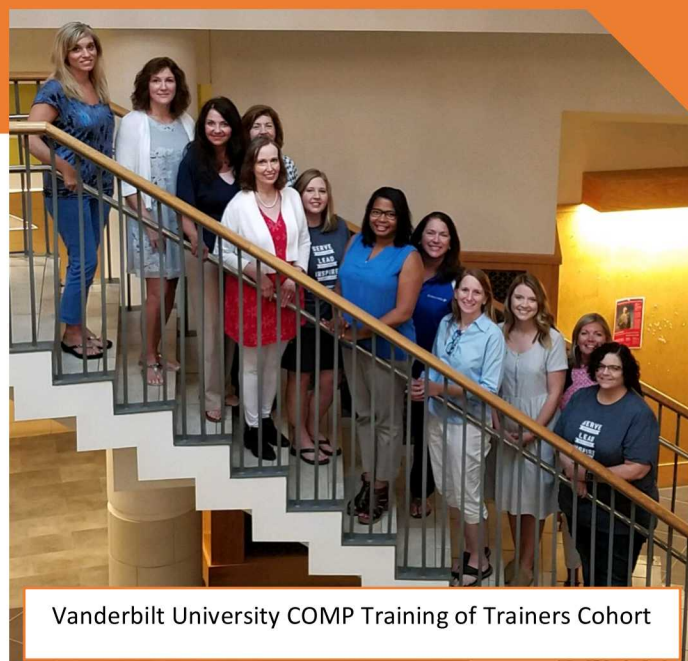
Vanderbilt University COMP Training of Trainers Cohort