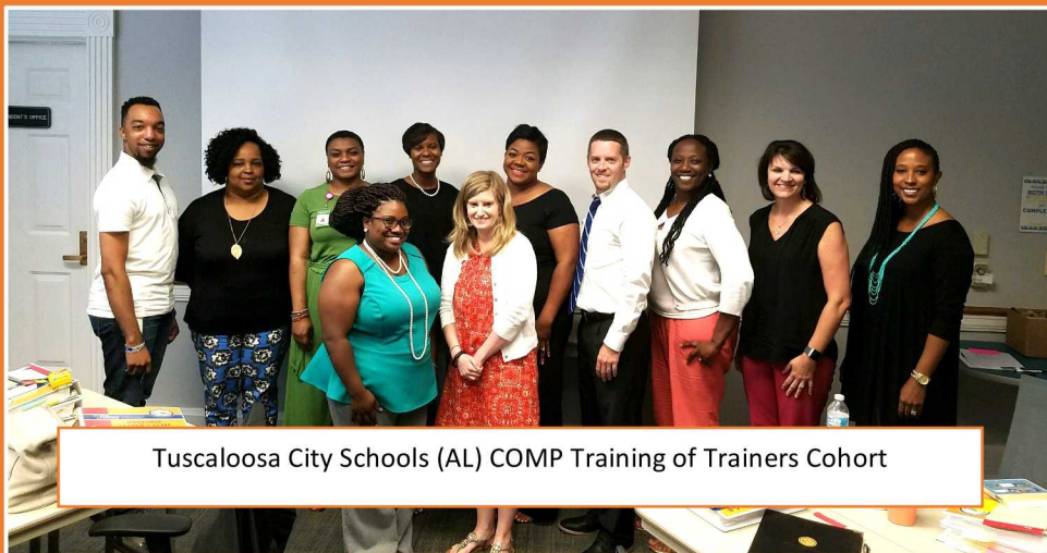
Tuscaloosa City Schools (AL) COMP Training of Trainers Cohort