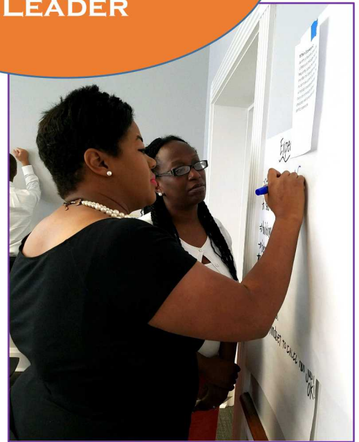
Participants in the Tuscaloosa City Schools (AL) COMP Training of Trainers brainstorm an effective response to a classroom scenario

Consider joining us for a future COMP Training of Trainers. Or, if you would like to host a TOT for your district, contact the COMP Office at 615-343-7800.